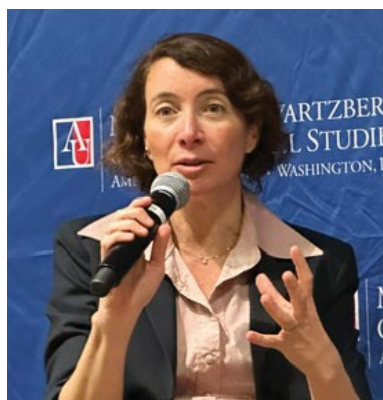
Left: Ayelet Gundar-Goshen. Right: Appreciative students at Etgar Keret lecture.