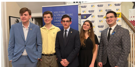
Members of AU Students Supporting Ukraine who attended the event