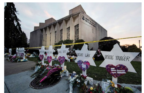
Memorial at Pittsburgh's Tree of Life Synagogue where, on 10/27/2018, an antisemite and White supremacist murdered 11 people