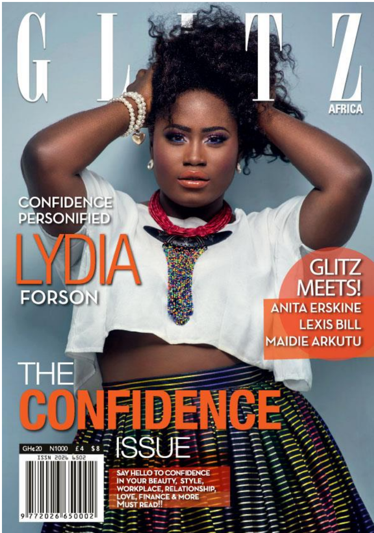
Lydia Forson Covers Glitz Magazine (Ade-Unuigbe).