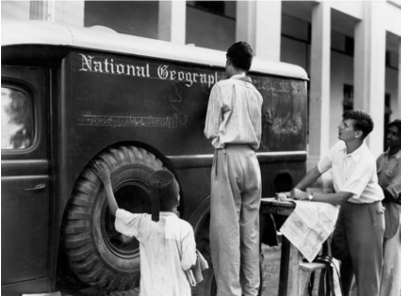
Bombay, India, 1946. Lettering the side of a converted ambulance for an expedition in India.

Mozambique, Timbuktu and Swaziland, and to Nepal and more. He photographed poverty and wealth, peasants and princes, always with sensitivity and unsentimental respect.