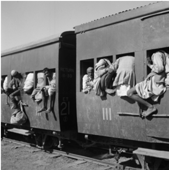
India, date unknown.