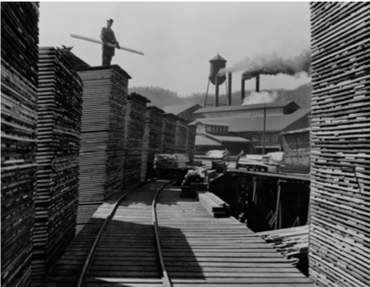
East Rainelle, West Virginia, date unknown. Aging wood at Meadow River Lumber Company waiting to be shipped.