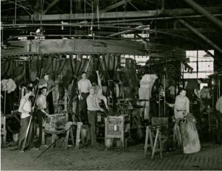
Louie Glass Company furnace, Weston, West Virginia, 1940. Glass objects were blown, partially aided by molds.