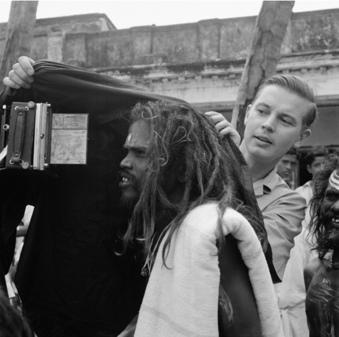
Madras, India, 1948. Volkmar Wentzel prepares to photograph a local resident.