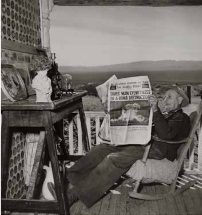
Nevada, 1950s. Atomic bomb test reported in the Los Angeles Times.