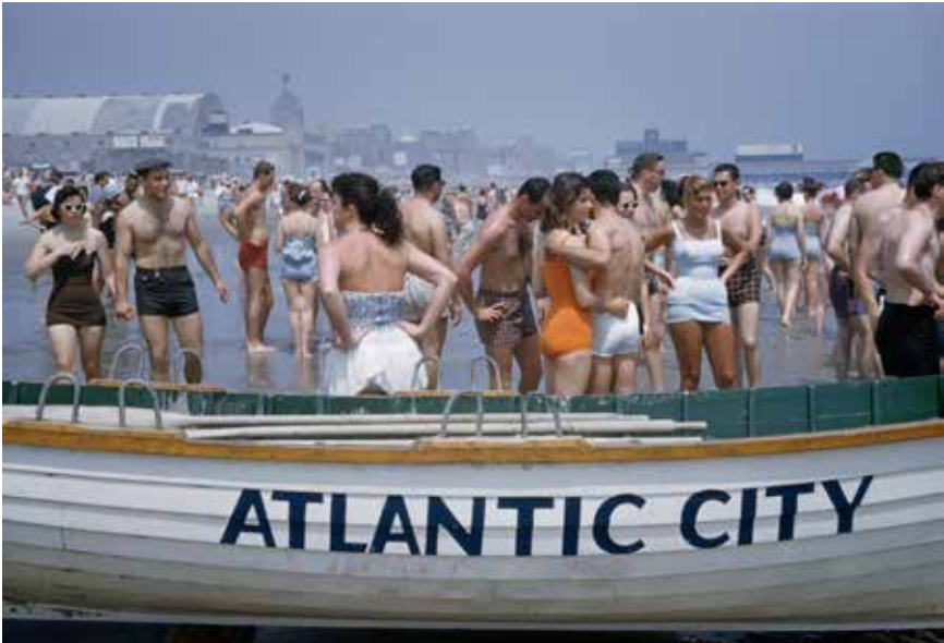
Atlantic City, New Jersey, 1958.

Opposite: Above New Mexico, 1960. A man leaps from balloon gondola at an altitude of 102,800 feet.