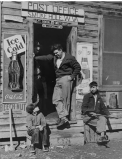
Smoke Hole, West Virginia, 1930s. Saturday afternoon in front of the Post Office.

he developed and printed his photographs. His talent began to reveal itself in photographs of Aurora community life—women quilting, men working, partying on a Saturday night, and the new Washington arrivals slaughtering and preparing pigs to feed the community.