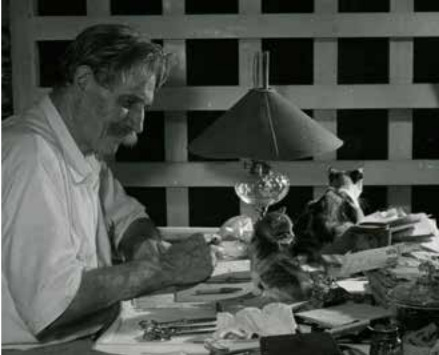
Lambaréné, Gabon, 1952. Albert Schweitzer at his desk with kittens.