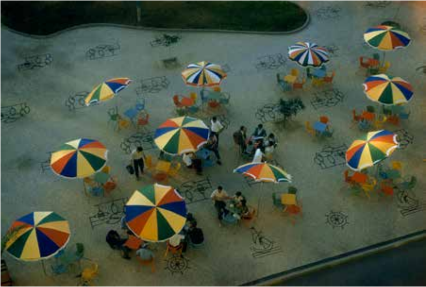
Benguela, Angola, 1961. City sidewalk.