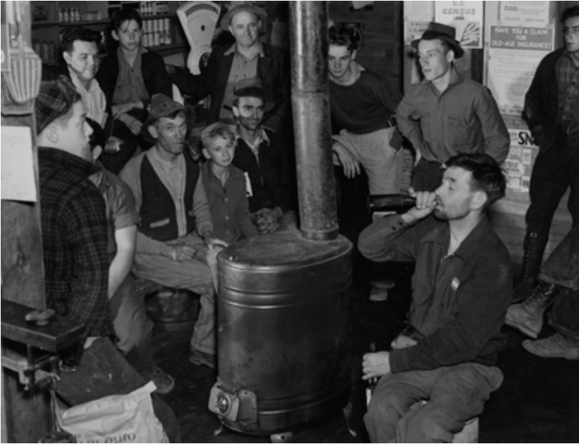
Smoke Hole, West Virginia, 1930s. Saturday afternoon gathering in the Post Office.