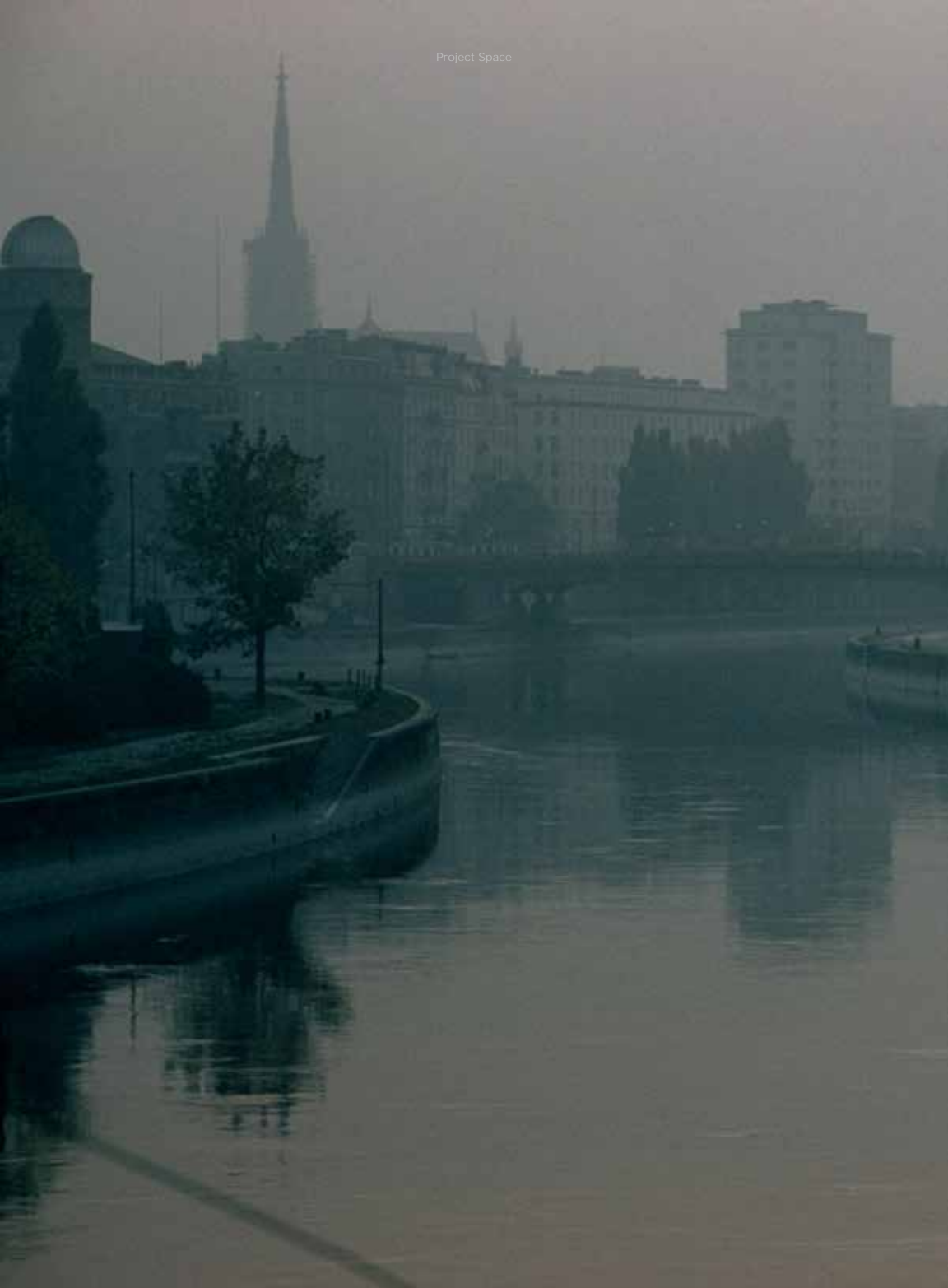
Vienna, Austria, 1958. River Danube flows past scaffolded buildings damaged in World War II.