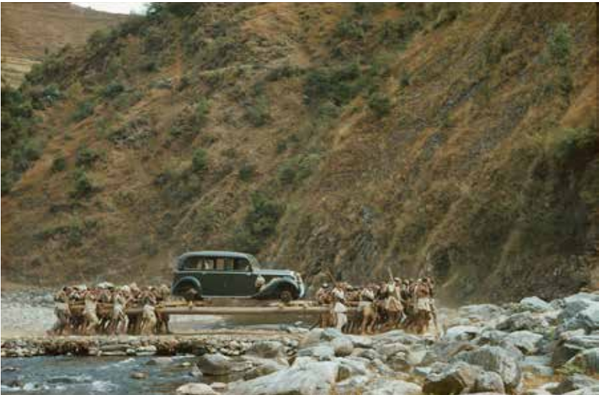
Nepal, 1950. Porters transport a vehicle across a stream.