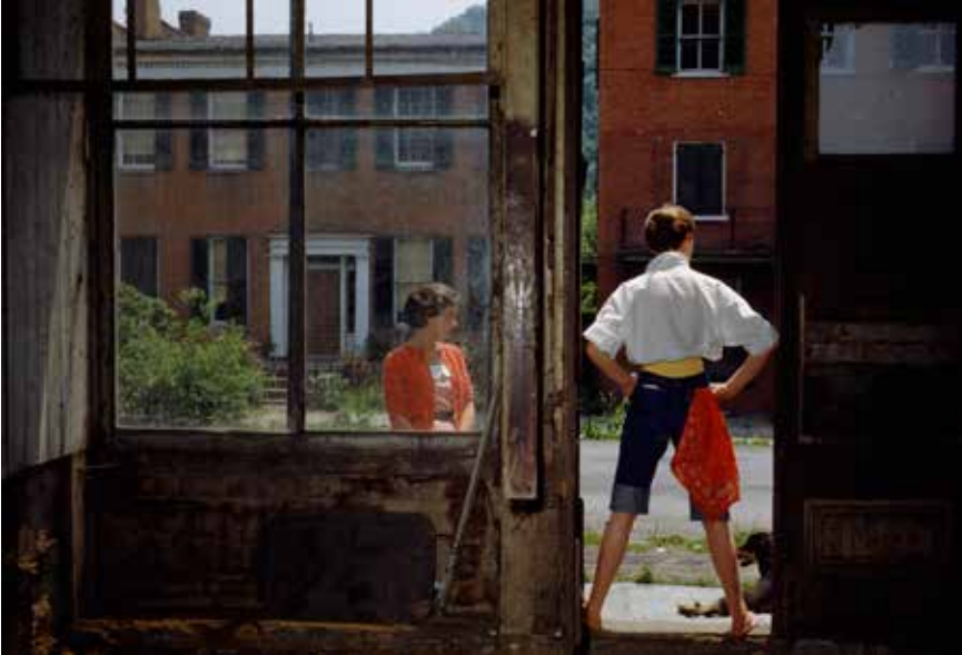
Harpers Ferry, West Virginia, 1956. Record of architecture in National Historical Park in need of renovation.

Previous page: Hickman, Kentucky, 1940. Small general store run by an African American family.