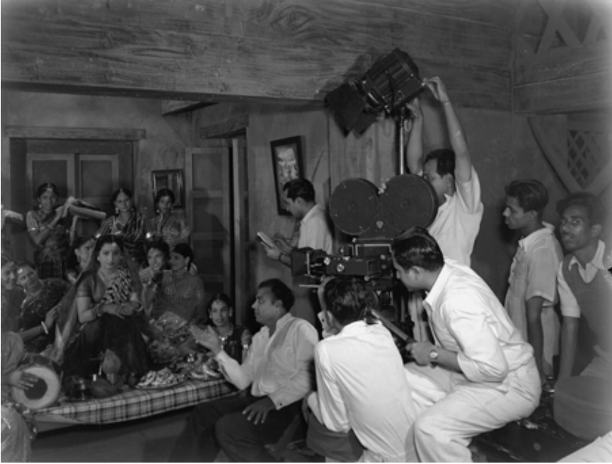
India, date unknown. Volkmar documents a crew filming local citizens.