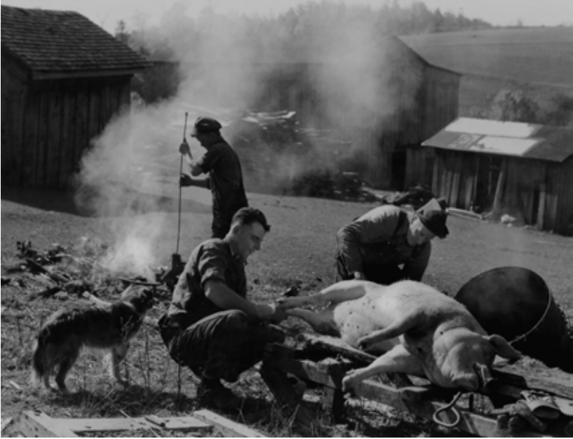
Aurora, West Virginia, 1930s. Slaughtering a sow.