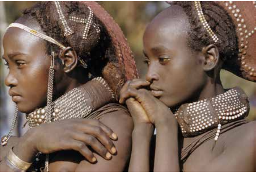
Angola, near Humpata, 1960. The coils of beads indicate these women are married.