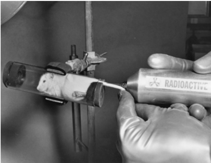
New York, 1953. Radioactive research.