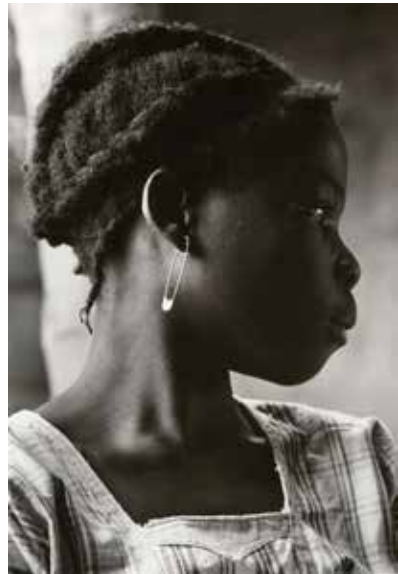
Angola, 1961. Portrait.