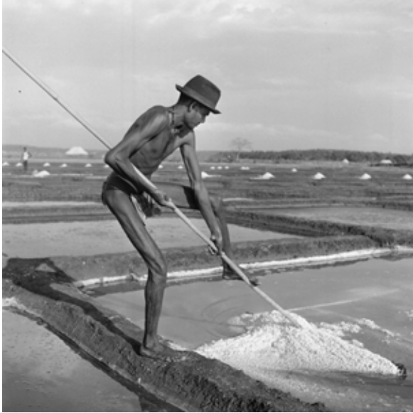
India, 1948. Raking salt in evaporation pond.