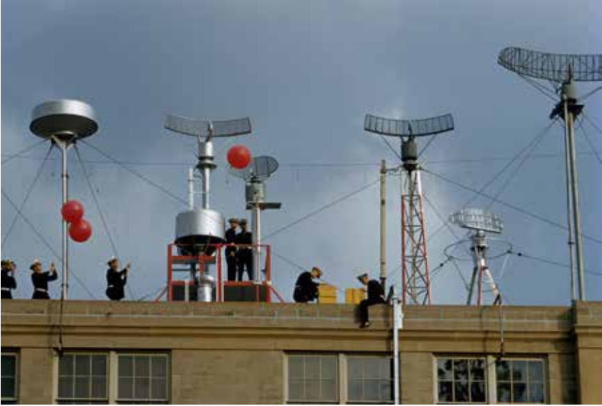
Kings Point, New York, 1955. Cadets learn to use weather balloons, radio set, and sextant.