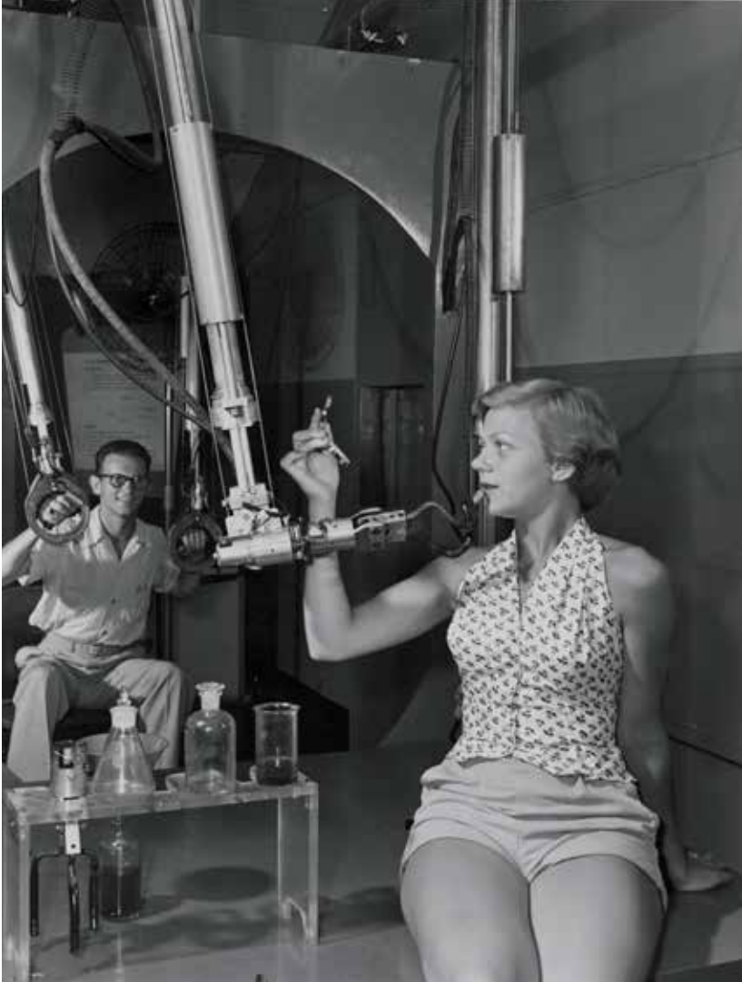
Oak Ridge, Tennessee, 1953. A dexterous mechanical hand applies lipstick.