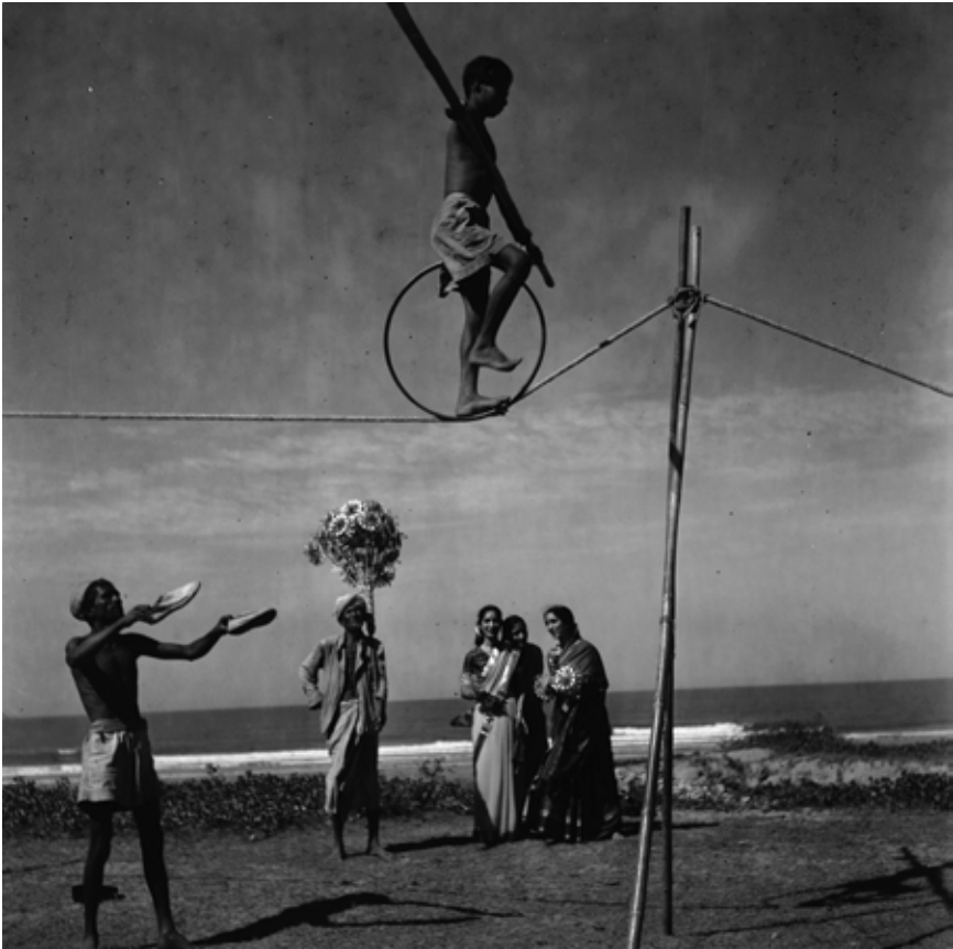
India, near Bombay, 1948. Performance.