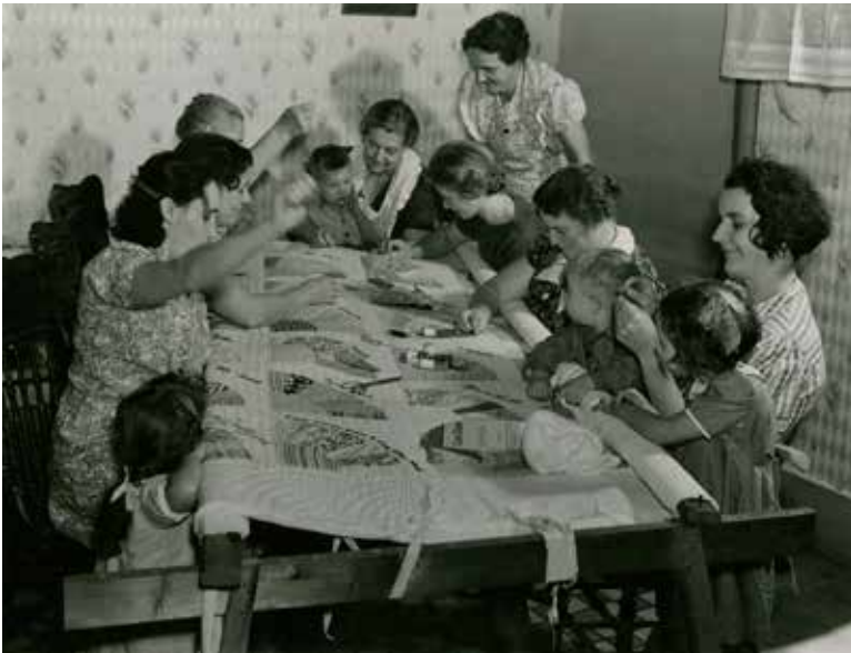
West Virginia, near Aurora, 1940. Quilting Party.