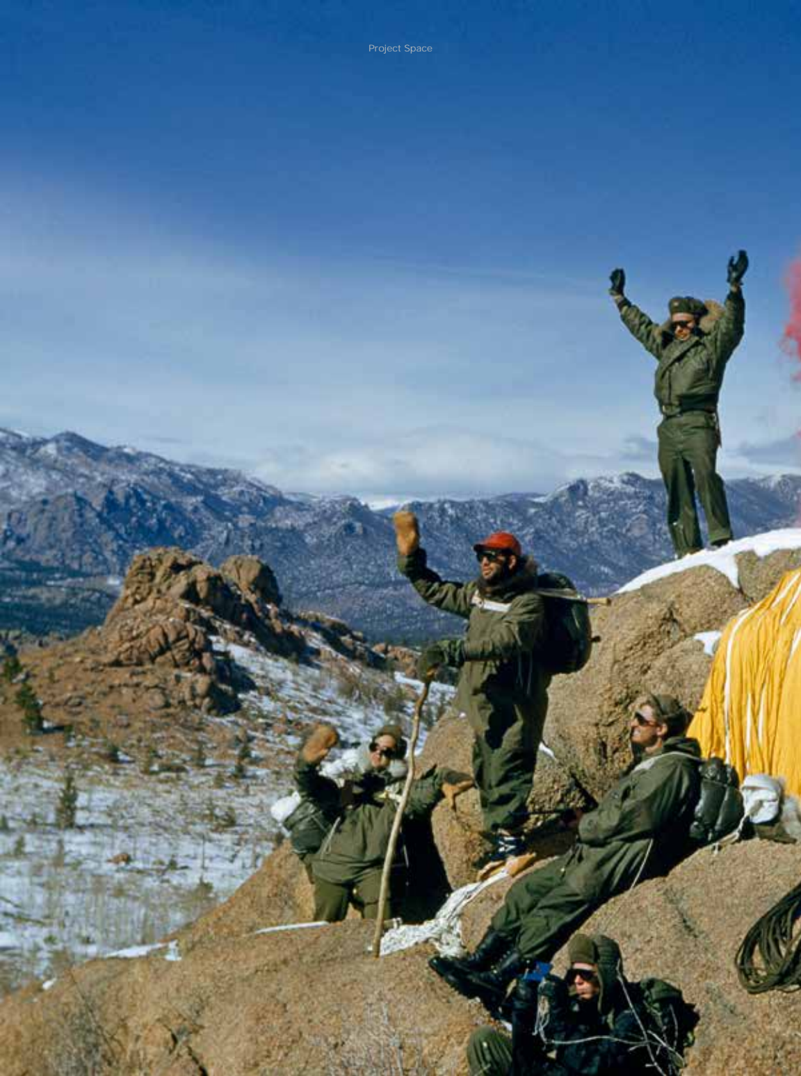
Colorado, 1950s. Soldiers and airmen preparing for winter cold, smoking pot.