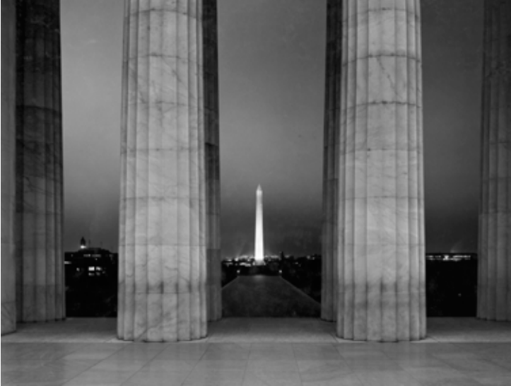
Washington, DC, 1930s. The columns of the Lincoln Memorial frame the Washington Monument at night.