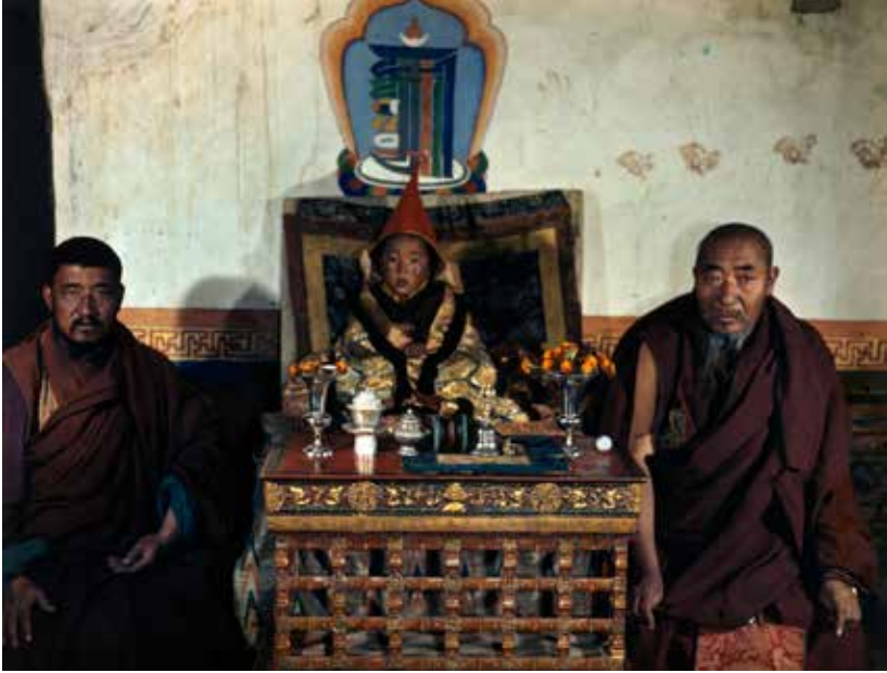
Ladakh, India, 1946. Religious ceremony.