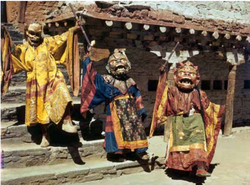
Ladakh, India, 1950s. Novice red lamas dressed as demons strike threatening poses.