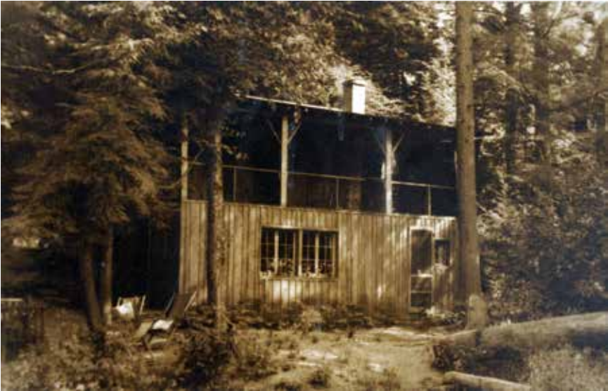
The Mary Goldman Cottage, Youghiogheny Forest, WV, 1935-1936.