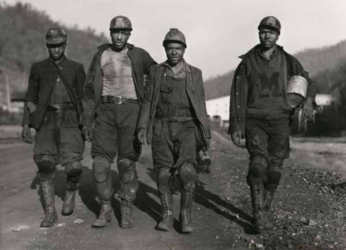
West Virginia, date unknown. Miners.