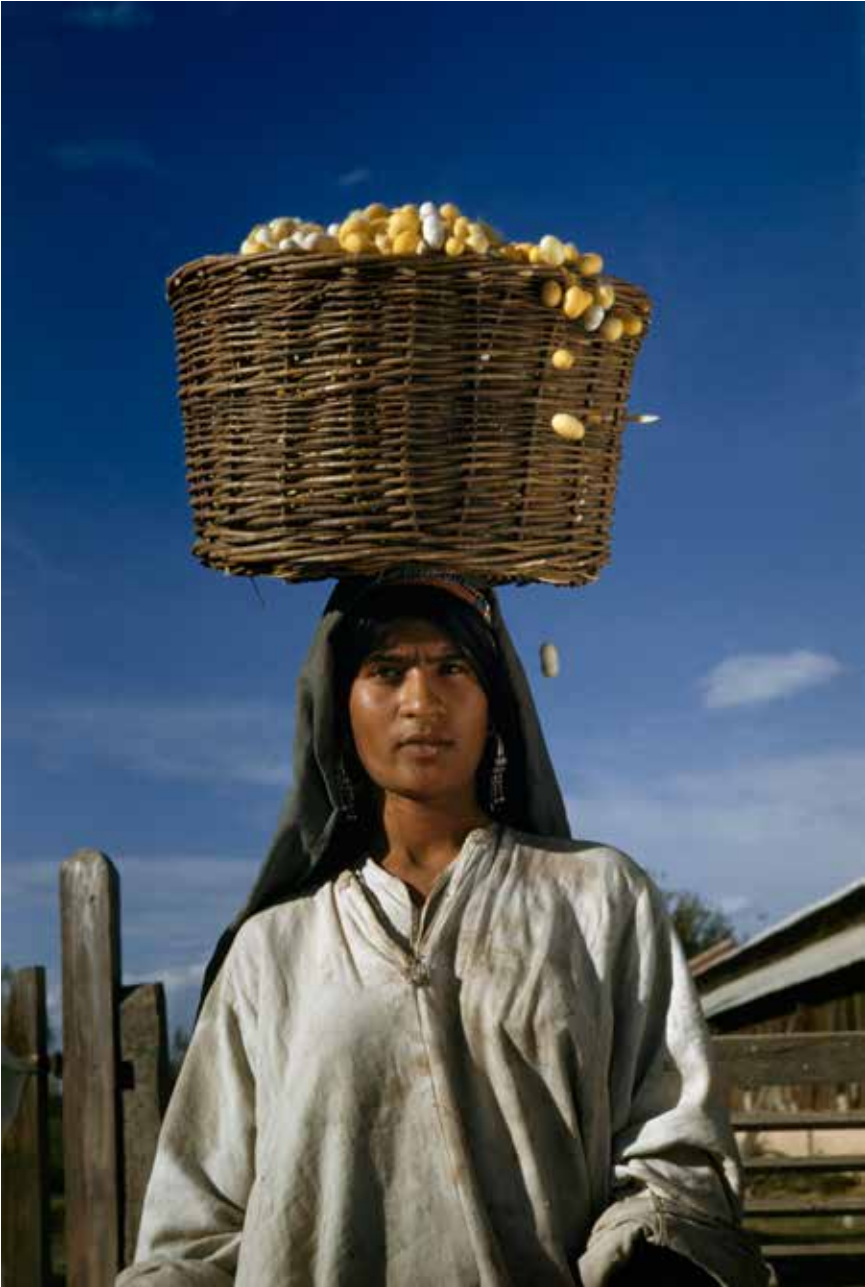
Jammu, Kashmir Province, India, 1940s. Silkworm cocoons tumble out of a basket.