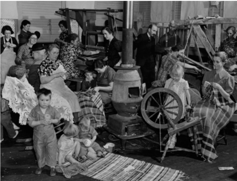
Asbury, West Virginia, 1939. Weekly weaving class for women (Reverend in back looks on).